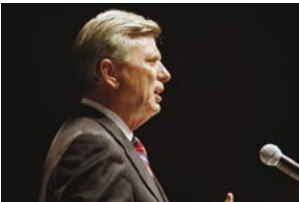
Arkansas Democratic Gubernatorial candidate Mike Beebe addresses the crowd at the Tuesday Evening Candidate Event in Horner Hall at the Hot Springs Convention Center. Beebe shared the stage with Republican Gubernatorial candidate Asa Hutchinson.

lowing their comments, both candidates talked about how they would deal with increasing crime rates, their approach to drug treatment and incarceration for offenders, incentives for small, minority-owned and disadvantaged businesses, how they would work with the Arkansas legislature and other topics.