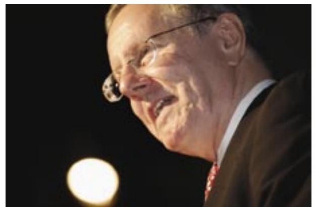
Steve Forbes, president and CEO of Forbes, Inc. was one of the keynote speakers at the Tuesday Opening Lunch Session. Forbes discussed the state of the American economy.

Hutchinson, a former congressman for Northwest Arkansas and a former official in President Bush’s administration, cited the state surplus, projected