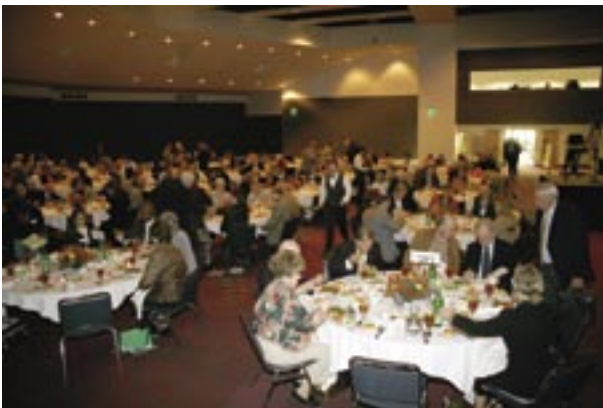
Attendees take their places for the Opening Lunch Session at the Arkansas State Chamber/AIA's 78 th Annual Meeting on Tuesday, September 26 th at the Hot Springs Convention Center.