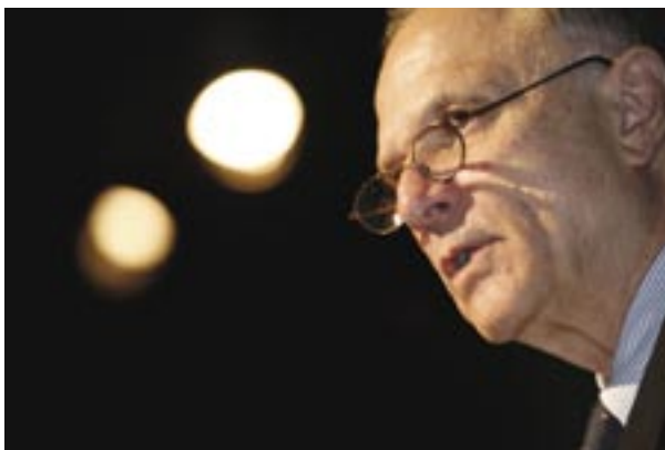
Former U.S. Senator and Arkansas Governor David Pryor introduces the first Leadership Arkansas class during the Opening Lunch Session.