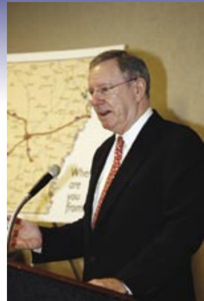
Steve Forbes, president and CEO of Forbes, Inc., addresses the Leadership Arkansas class at the Hot Springs Convention Center.

• Support legislation that preserves and/or enhances the education reform measures supported by and consistent with the State Chamber/AIA's Position Statement on Education, specifically including, but not limited to, the Omnibus Education Act, the Act 35 Accountability legislation, including the