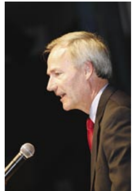
Arkansas Republican Gubernatorial candidate Asa Hutchinson makes a point during his appearance at the Tuesday Evening Candidate Event. Hutchinson and Democratic Gubernatorial candidate Mike Beebe sparred verbally over possible state tax cuts and other issues.